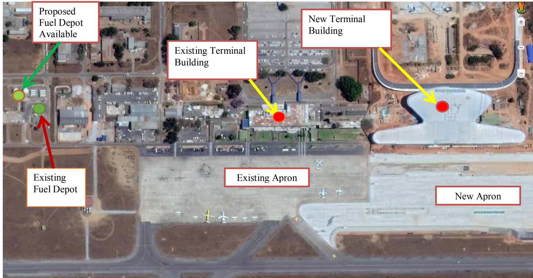
Figure 1.1 Airport General layout-Kenneth Kaunda International Airport general layout map showing locations of: existing and new Terminal Buildings, aircraft aprons, JET A1 fuel Depot facilities and proposed locations for the new fuel farm/Depot